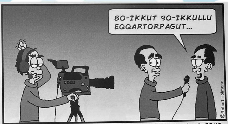
VI SNAKKEDE OM 80-ERNE OG 90-ERNE

What did you talk about at the Future Greenland conference?