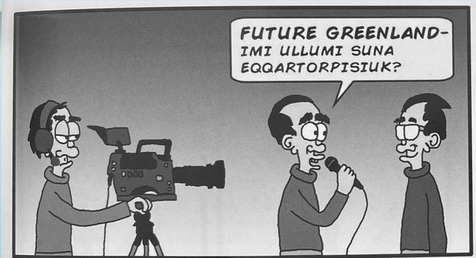
HVAD SNAKKEDE OM I FUTURE GREENLAND IDAG?