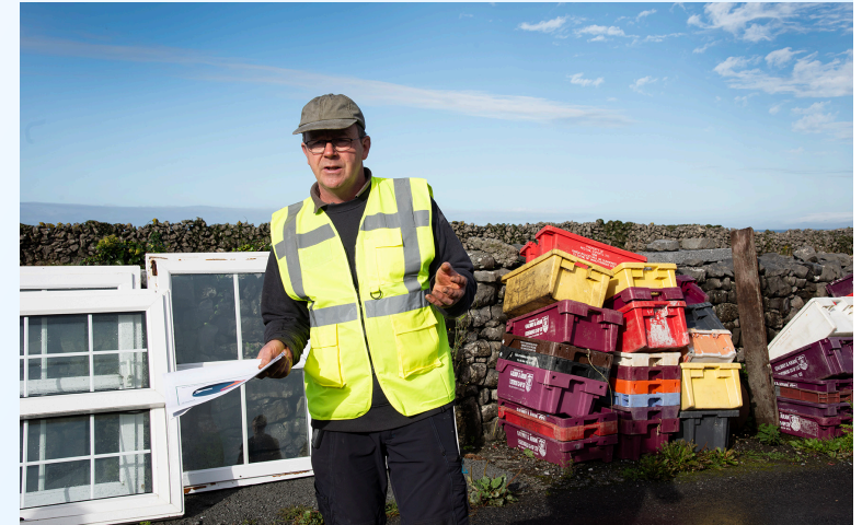
The Aran Islands Co-op Recycling Project, Ireland

What is needed to make it easier to start and develop sustainable social enterprises in rural areas?