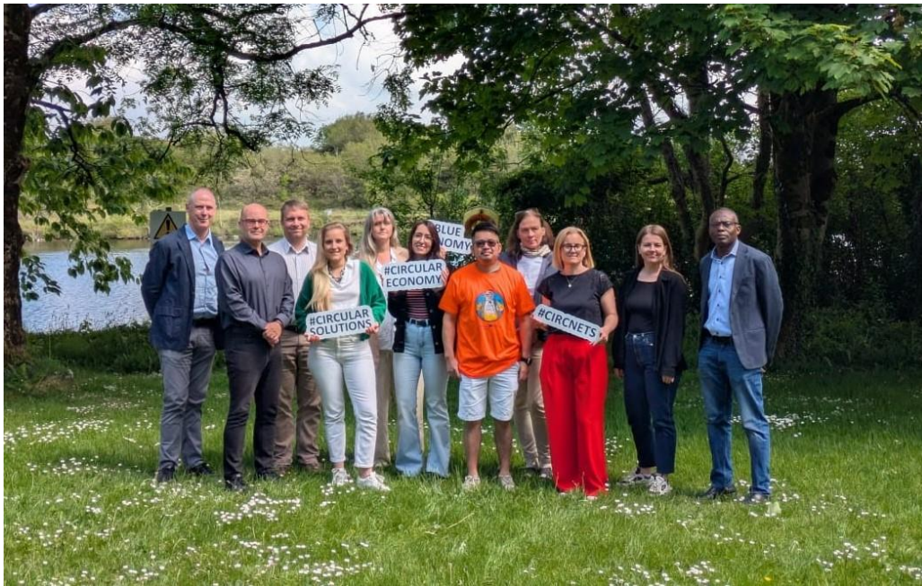
CIRCNETS team in Galway