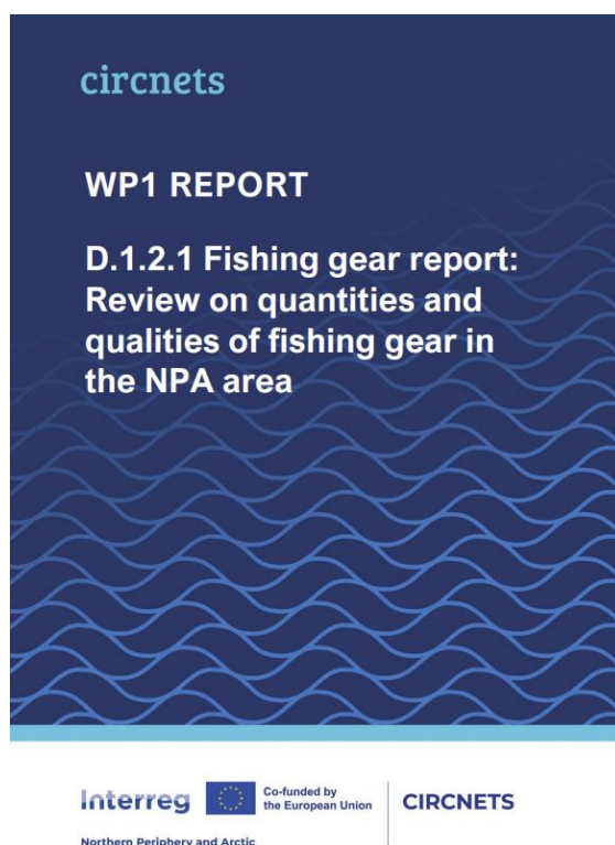
Cover of the D.1.2.1 report

The second deliverable report of Work Package 1 has been published. WP1 focuses on creating an overall picture of the current status of EOL fishing gear. The second report is titled “Fishing gear report: Review on quantities and qualities of fishing gear in the NPA area”. After introduction, the second chapter describes the material composition of fishing gear used in NPA countries, followed by the third chapter looking into the manufacturers and importers of fishing gear in NPA countries, the fourth and fifth chapters assessing the quantities and qualities of fishing gear put on the market and in use in the NPA area, and finally chapter six brings all this together for a material flow analysis, followed by conclusions.