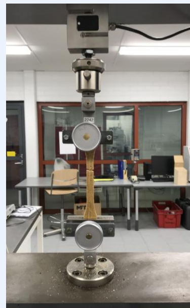
Material mechanical test