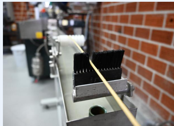
Custom filament manufacturing for FDM printing