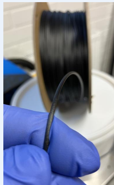
Custom FDM filament