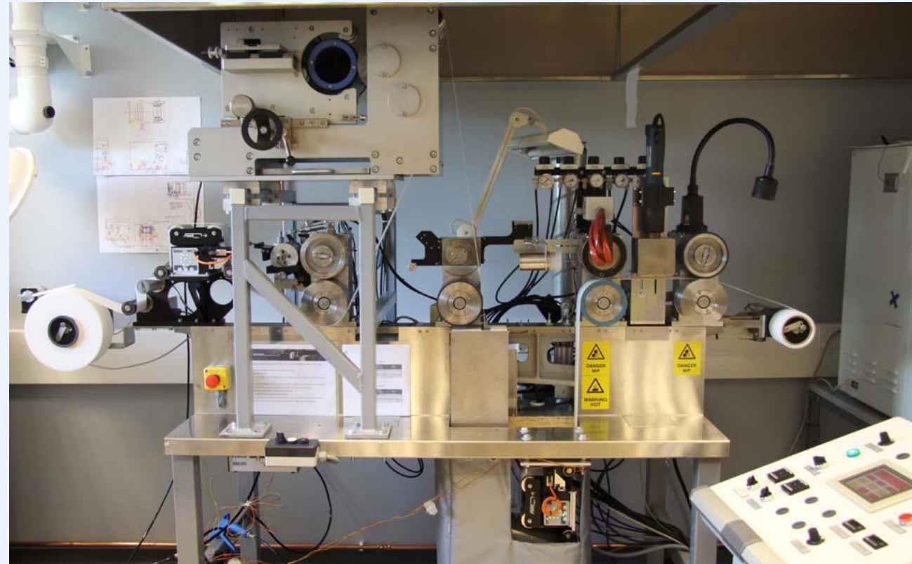
R2R printing machine SOM-100